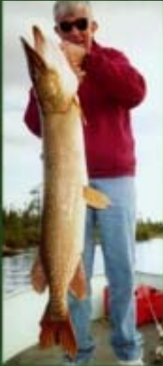
50" Pike - Don R. Edwards Inlet 2001